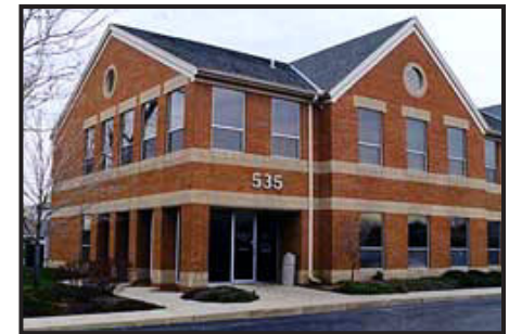
535 OffiCenter Place