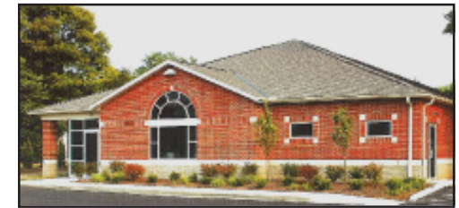
1219 W. First Street